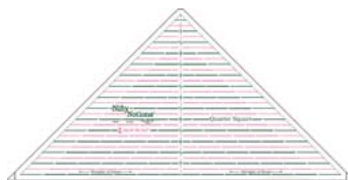
Quarter Square (NNQS)