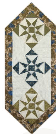
Table runner is 3 blocks with side cut using the Side Set (NNSST) ruler as shown on the DVD